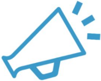
1. The Announcement

We recommend four communication “pushes” during your campaign: The Announcement , The Celebration , The Urgency Builder and The Last Chance .