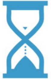
4. The Last Chance