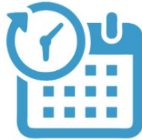
3. The Urgency Builder